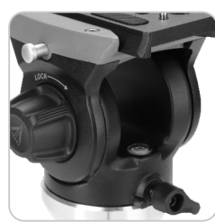
Fixed pan & tilt drag for smooth movement.