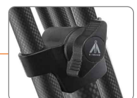
Ergonomic hand locking knob.