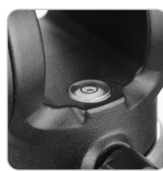
A built-in bubble level to assist balancing.