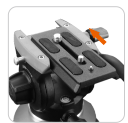
Quick release plate.