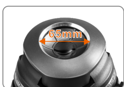
65mm bowl size.