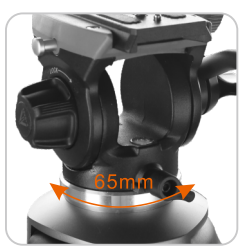
65mm bowl size.