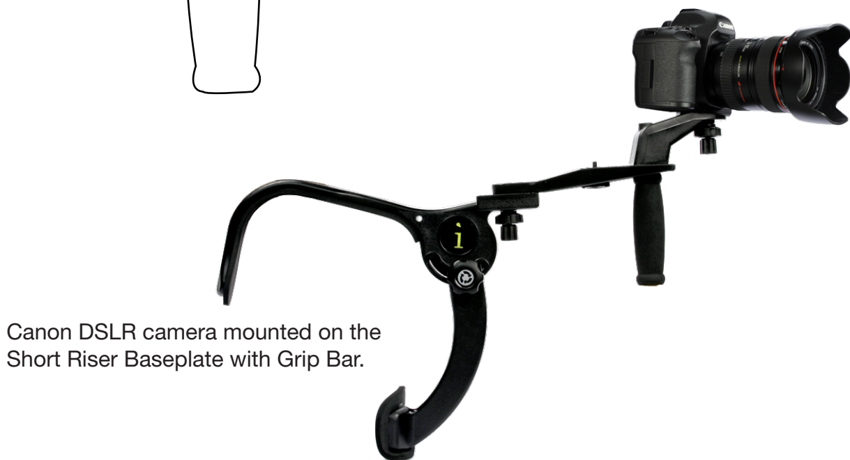
Canon DSLR camera mounted on the Short Riser Baseplate with Grip Bar.