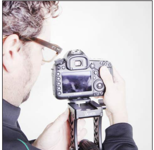
The Camera may be mounted on a camera quick release plate