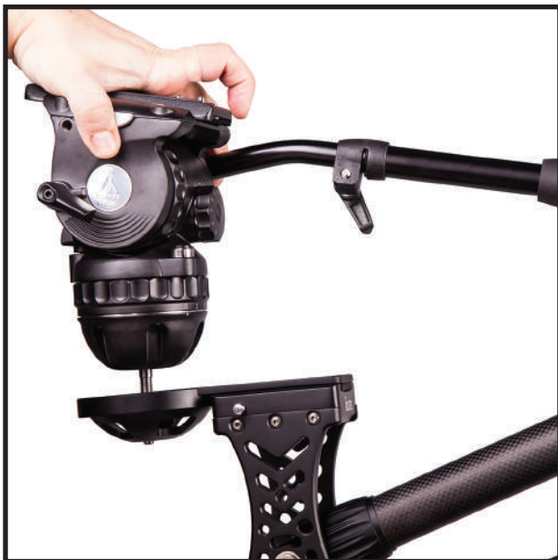
Also a Fluid head may be mounted on the included 75mm quick release bowl plate