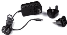
CHARGER & PLUGS