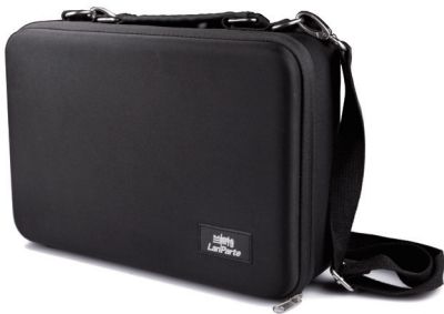
BAG with SHOULDER STRAP