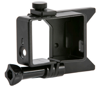
GoPro CRADLE MOUNT