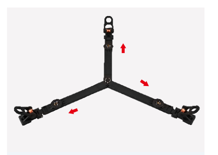
Extendable Ground Spreader Extendable spreader is designed to offer added stability to the tripod.