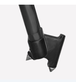
Removable Rubber Feet Removable feet attach to the spiked feet for working on delicate or hard surfaces.