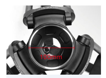
100mm Bowl Size Compatible with all professional 100mm half-ball video heads.