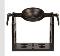
IK-RSRS 6" Camera Riser Hi-Hat with Swivel