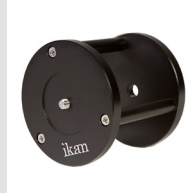
IK-RSR3 3" Camera Riser