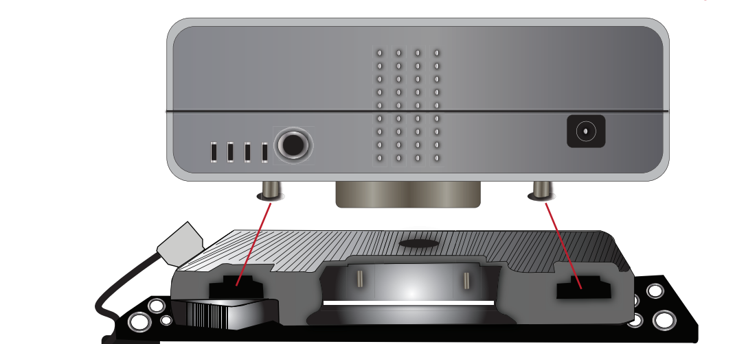
AB Mount Professional Battery

ikan's Pro Battery Rail Kit, designed for BlackMagic Cinema Camera, is easy and simply to use. Attach your Probattery (Anton Bauer or V-Mount) to the battery plate and make sure it is secure.