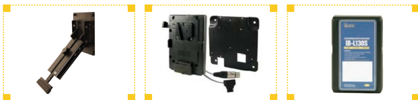
MKS Monitor Kick Stand $49.95