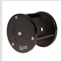
IK-RSR3 3" Camera Riser