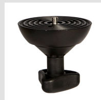
100BF 100mm Ball to Flat Adapter