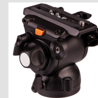
GH03F Flat Base Pro Fluid Head 11 lbs Max