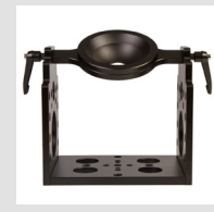
IK-RSRS 6" Camera Riser Hi-Hat with Swivel