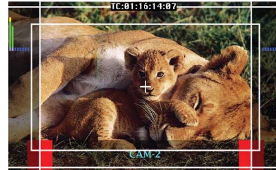
Audio Level Meter / Marker / Source ID display / Timecode display / UMD (Under Monitor Display)

AFD is supported allowing for automatic display at proper aspect ratio in all PRM series (except PRM-502LE & PRM-207Q). Additional features (vary by model) include RJ11 remote control, tally, H/V delay, blue only/monochrome, selectable LTC or VITC time code and on-screen source display, 16 channel embedded audio metering, various markers (including user defined) and safety area modes, SDI input auto detection, and user-friendly menu interface.