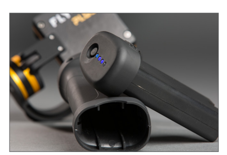
NOTE: Additonal Batteries may be purchased.

When the RED LED light blinks, please recharge battery. Remove battery from handle to check battery level. Press once to check power level and press again to power off.