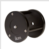
IK-RSR3 3" Camera Riser