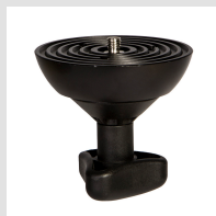
100BF 100mm Ball to Flat Adapter