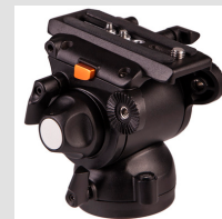
GH03F Flat Base Pro Fluid Head 11 lbs Max