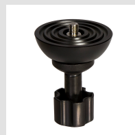
75BF 75mm Ball to Flat Adapter