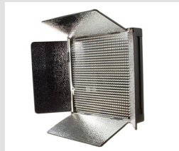
IDMX1000-v2 Studio Light w/ Touchscreen