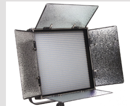
IFD1024 Daylight Featherweight Light w/ AB & V-Mount Plates