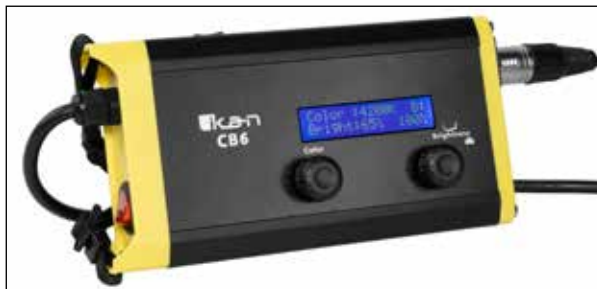
Illustration of light's dimmer: